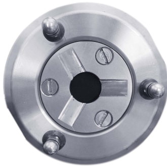
O 2 O Optical