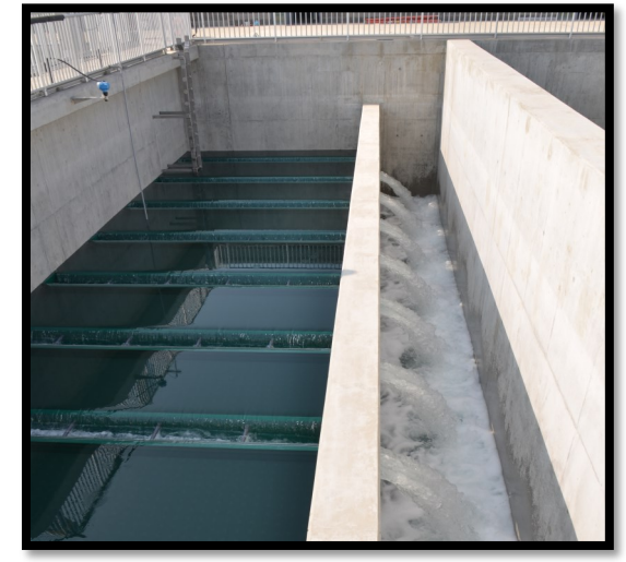
Poseidon Filtration System®

Orthos' Centurion<sup>™</sup> structurally-superior filter underdrains feature nozzles with solid-expelling slots, specifically-sized to retain the DDBF <sup>™</sup> media and prevent biological fouling. No gravel layer is necessary, which reduces hydraulic profile and eliminates related horizontal short-circuiting.