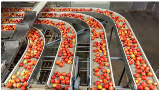
Food Processing Plant