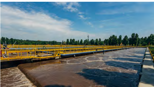
Wastewater Treatment Plant